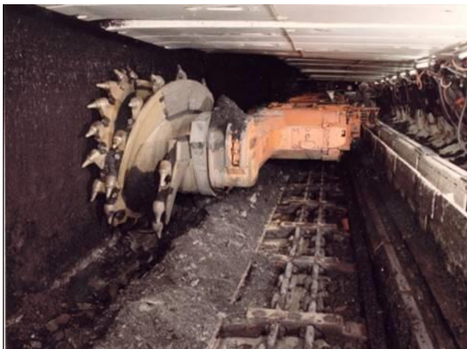
A coal shearer in action. Shields above and to the right. Conveyor below.