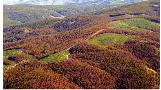
Lodgepole pines killed by bark beetles

On Friday, August 9, we drove 52 miles southeast over award-winning Rabbit Ears Pass to the small town of Kremmling, to visit a wood pelletizing plant. The plant was established by Confluence Energy LLC in response to Colorado’s “red tree” problem. Red trees are pine trees that have died because of infestations by pine bark beetles. The beetles chew holes through a tree’s bark and lay their eggs within. The beetles carry a fungus, which grows in the holes and eventually chokes off the tree’s circulatory system. The fungus leaves a blue stain in the wood, which some consider decorative, but it is the red needles – denoting a dead pine tree – that have attracted the most attention. Foresters predict that 95% of Colorado’s lodgepole pines may soon be dead or dying. The dead trees present a serious fire hazard, and when they fall they will create a major impediment to travel through the forests, especially for people and other large animals.