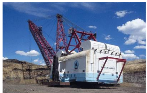
Trapper Mine’s Queen Anne dragline

Much of Mr. Luke’s presentation was focused on environmental planning and the reclamation programs that Trapper Mining employs and how pleased they are with the results. After a Q&A session, we rode the bus to an active mining area where we watched one of Trapper’s three draglines at work. A dragline’s bucket can move the equivalent of 1-1/2 truckloads of dirt and rock in one gulp. We also had the opportunity to observe a working face, where coal was being extracted and loaded into large trucks.