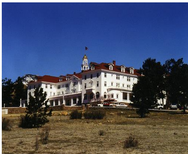
The historic Stanley Hotel in Estes Park, Colorado