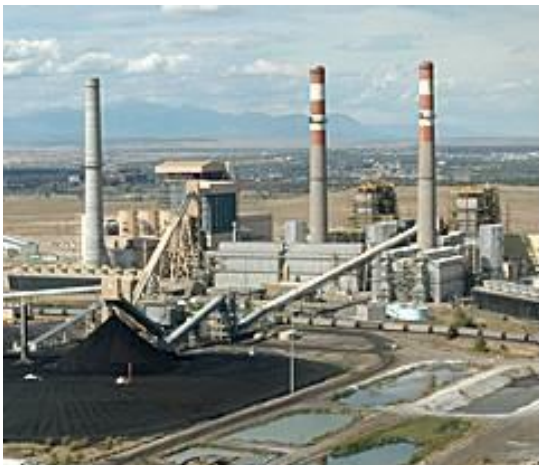
Commanche Generating Station, near Pueblo At 1426 MW, the largest power plant in Colorado It burns Wyoming coal in 3 units and is operated by Xcel Energy

A short walk took us to the first of our sites -- the Denver headquarters of Xcel Energy Inc. , where the utility's energy dispatch center is located. Minneapolis-based Xcel Energy is investor owned and supplies electricity to 3.3 million customers in eight states through three operating companies – Northern States Power, Southwestern Public Service Company, and Public Service Company of Colorado. Xcel generates about two-thirds of its electricity and buys the rest from power authorities and other utilities. Xcel operates 81 generating stations, with a total capacity of 17 gigawatts. Energy sources include coal, natural gas, uranium, wind, water, fuel oil, sunlight, and biomass.