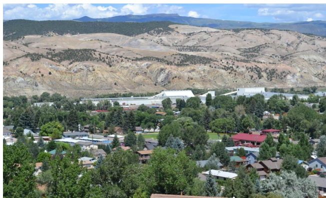
American Gypsum's Eagle Plant, in Gypsum, Colorado

The mineral gypsum has served many useful purposes for thousands of years. Gypsum deposits are found in many regions, including the Montmartre district of Paris, the Cave of the Crystals in Mexico (where gypsum crystals are as long as 40 feet), and dunes near the north pole of Mars. One of the largest deposits is in the White Sands National Monument in New Mexico, where gypsum sand covers 270 square miles.