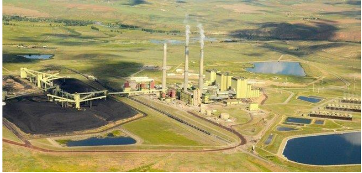
Craig Generating Station