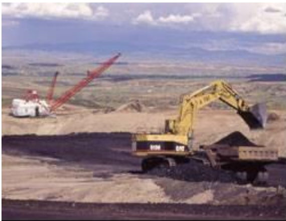
Coal mining at Trapper Mine

Coal is a sedimentary rock that was formed by the accumulation and preservation of plant materials, usually in a swamp environment where enough oxygen was present to support microbial action but not enough to completely oxidize the organic substances into carbon dioxide and water. As plant debris accumulated in a swamp, heat produced by the microbial action accumulated in the layers, and the rising temperature (and pressure) caused changes to occur in the physical and chemical characteristics of the organic matter, eventually producing the mineral that we now call coal. The cumulative changes are called “coalification.” One very significant aspect of coalification is a decrease in the content of light, volatile organic compounds and an increase in the carbon content of the debris, a process called “carbonization.”