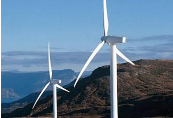
Vestas Wind Turbines - Nacelles on towers behind blades