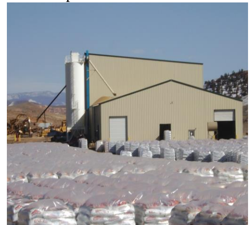
Confluence Energy LLC with a backlog of pellet fuel

Some Colorado communities have taken advantage of the epidemic, by using the dead and dying trees as a fuel source, replacing expensive fossil fuels, especially propane. For example, the middle school in Oak Creek replaced an aging coal-fired heating system with a modern system that burns wood pellets made from beetle-killed pine. Those pellets are manufactured 50 miles away, at the Confluence Energy facility. About 200 tons per day of logs are shredded and dried and pressed into pellets. The pellets are about ¼-inch in diameter