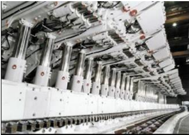
Roof Supports (Shields) for Longwall Mining

After our tour, we drove west through beautiful Glenwood Canyon to Glenwood Springs, where we spent the night at the Hot Springs Lodge. On Wednesday August 7, we rose early and drove south along the Roaring Fork and Crystal rivers, past Carbondale and Redstone and Marble and over McClure Pass to Somerset, where we divided into groups to tour two underground coal mines: Arch Coal's West Elk Mine and the Bowie No. 2 Mine of Bowie Resources Ltd. We were not able to tour Oxbow Mining's Elk Creek Mine, which was recovering from a fire.